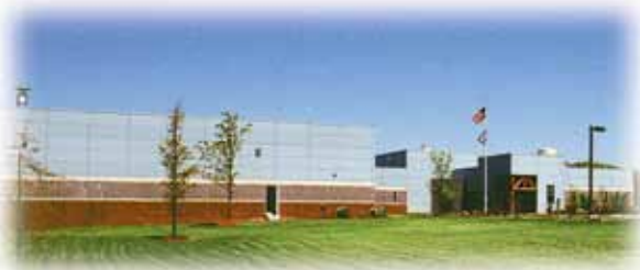
Wood Education and Resource Center

The area's quality stands of hardwoods make the county an attractive location for primary processors and secondary manufacturers of wood products. A U.S. Forest Services Laboratory and the Wood Education and Resource Center, located near Princeton, provide assistance in hardwood research, utilization and marketing.